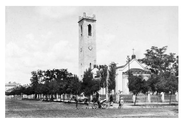
Kishinev Lutheran Church